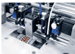
Bottom suction feeder