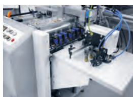
Komfi feeding head